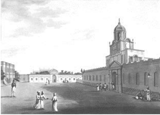
Fig. 2. Fort Square, Fort St. George, Madras