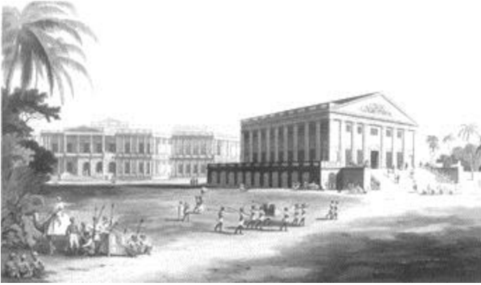
Fig. 4. Banqueting hall (1802 CE) now known as Rajaji hall, Madras