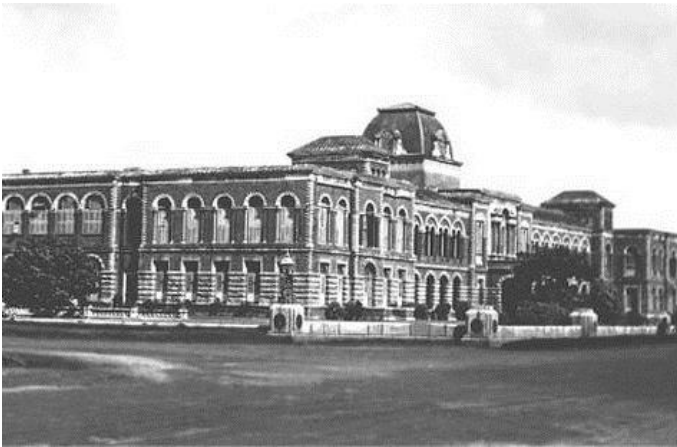
Fig. 5. Presidency college, Madras