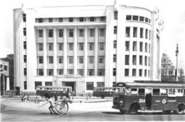
Fig. 6. Parry building, Madras