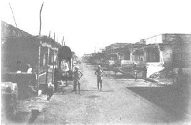
Fig. 3. View of a Street in Black Town, Madras