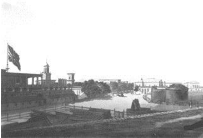
Fig. 1. View from the King's barracks Fort St. George, Madras

Wheeler, J., Madras in the Olden Time , Madars, 1993.