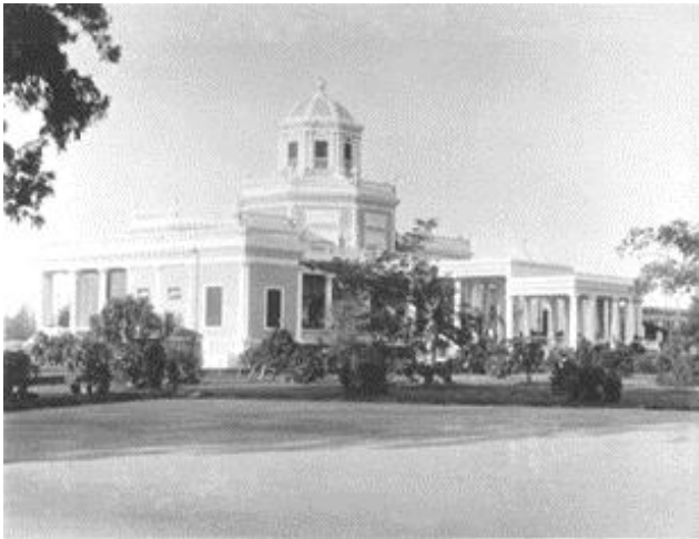
Fig. 7. The Moubray's Garden house, Madras